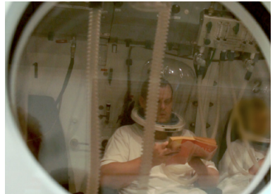
« Under Pressure » by Johan Ask Pape